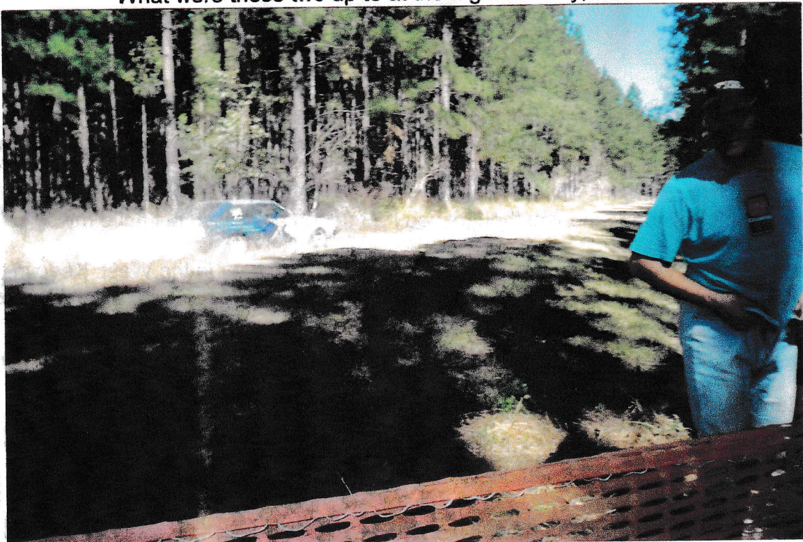
Check out the next photo of someone else providing extra scenery as well !