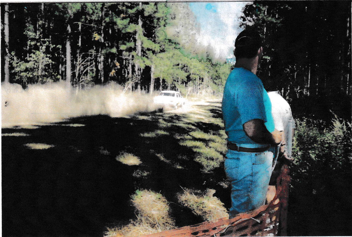
What were these two up to at the Ingham Rally, I wonder!